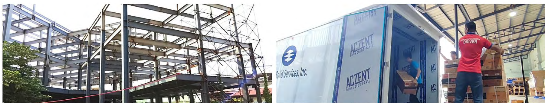
Dagupan City commercial development (left) · OMNI Solid Services fleet expansion (right)

We will maintain conservative leverage, adequate liquidity, and a balance sheet that preserves flexibility to act when the right opportunity arises.