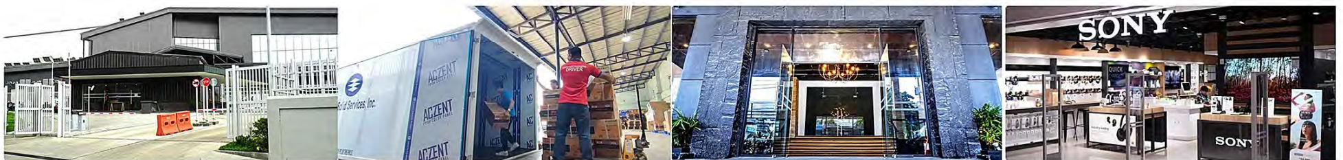
Across property, logistics, and distribution — SGI's presence spans the Philippines.

Businesses that serve the Filipino people — providing employment, goods, services, and housing across the country. SGI's 15 subsidiaries operate across Metro Manila and the provinces, serving consumers, institutions, and commercial clients.